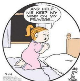
“...and not on that TV show Daddy’s watchin’ or Billy jumpin’ on the bed or whatever Jeffy is mumbling or ...”

Special thanks to all of those helpers that assisted in moving the hymnals, bibles and miscellaneous items that were taken back into the sanctuary after Labor Day. The sanctuary had a much needed clean-up as well.