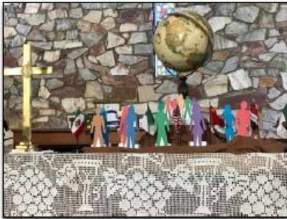
World Communion Sunday